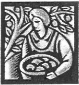
Harvest (fruit and vegetables)