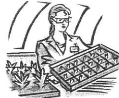
Greenhouse, Nursery, Sod

Parent/Guardian Name: _____ Phone: _____