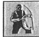
Fishing, fish Processing